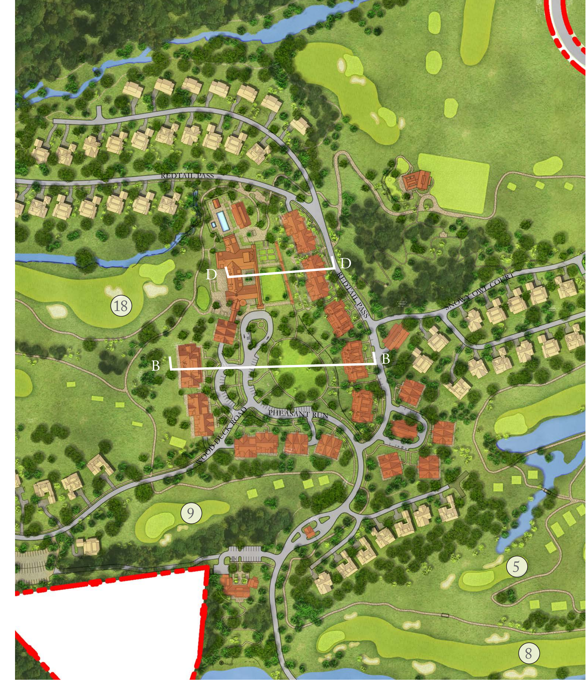
KEY PLAN (NOT TO SCALE) North